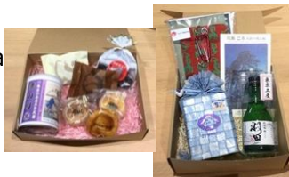
※ Gift images

Once the rainy season is over, summer vacation begins. This is a season where people go back to their homeland or go traveling. Consider a gift from Ota to those you will meet.