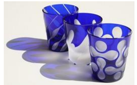
"Kamata Modern GUINOMI"

We organized this special exhibition with the cooperation of Forest, producing "Kamata Kiriko". You can see the beauty of traditional craftsmanship born in Kamata, such as the displays of limited edition pieces, and the introduction of Kamata Kiriko's production process. We provide information about the "Kamata Modern" era, born in the Kamata district during the Taisho to Showa era, the Forest's shop on Kugahara Lilac Street, and tips about walking around the area. Please stop by our tourist information center!