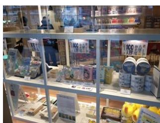
※The photos represent last year's event.