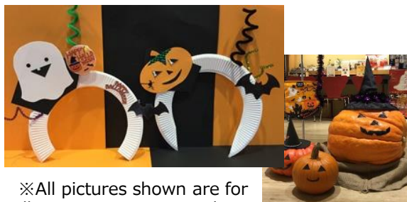
※All pictures shown are for illustration purposes only.

※Reservation not required / accept up to elementary school students.