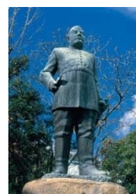
Saigo Takamori Bronze Statue

Did you already participate in "Bakumatsu and Meiji Stamp Rally" being held from August 25? While eating the limited edition "Katsu-don" and "Sego-don" meals in commemoration of the "150 bloodless years" after the launch of the Edo Castle", the stamp rally takes you around the land of the people who played an active role during the end of the Edo and Meiji era following the footsteps of Katsu Kaishu and Saigo Takamori.