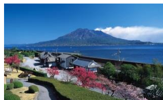
The Shimazu house "Sengan-en" and "Sakurashima" Island

OTIC is one of stamp stations and an exchange spot. Also popular local food such as "Karukan" steamed sweet bun and "Satsuma-age" deep-fried fish paste" will be sold in cooperation with Kagoshima Prefecture and Kagoshima Yurakukan.