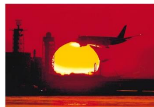
※ First Prize

21 award winning works were selected from 379 entries and are displayed. Don't miss the opportunity to see the award winning photographs of Ota City.