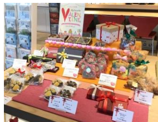
*Exhibition last year