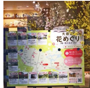
*Exhibition last year