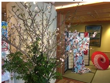
*Exhibition last year

With fresh cherry blossoms and relating sweets sold at Ota TIC, the rest of spring season can be enjoyed.