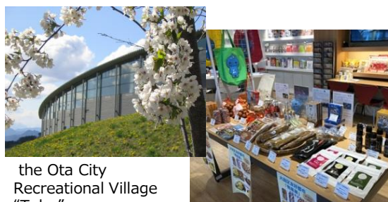
the Ota City Recreational Village "Tobu"

Do you know friendship cities of Ota City? Ota City has concluded friendship city collaboration agreements with domestic three cities such as Misato-cho, Akita Pref., Tomi City, Nagano Pref., and Matsushima City, Miyagi Pref. Also, internationally with Chaoyang District, Beijing City, China. Salem in Massachusetts, USA became a sister city of Ota.