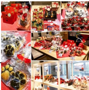
*Exhibition last year

*Visit our website for more information.