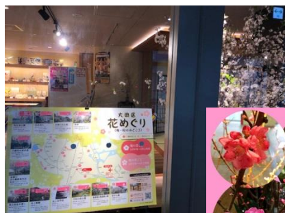
*Exhibition last year