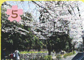
Rokugo Yosui Promenade

📍 18~43 Den-enchofu-Honcho, Ota-ku ✈️📍 41mins