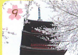
Ikegami Honmonji Temple