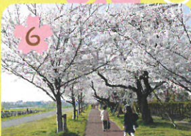
Area around Tamagawa Gasubashi Green Space

📍 Area around Den-enchofu-Minami, 1~3 Chome Unoki, Ota-ku ✈️📍 39mins